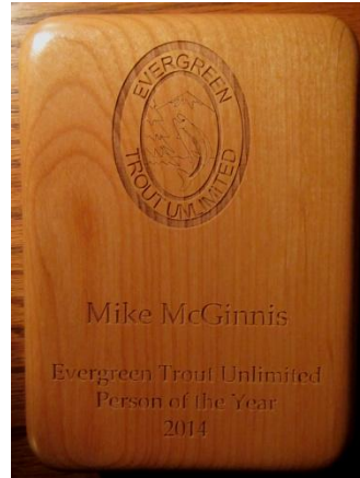
Commemorative fly box

craft beers, fine wines and some not so fine wines. Many fish stories (lies) were swapped, and all participated in the free bucket raffles, which serve as a sort of holiday gift exchange. There were flies, books, culinary articles, shirts and some gently used unique items in the raffle. Competition for the items was fierce.