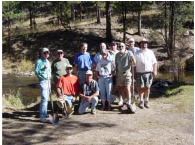
The Dirty "Fisherman's Dozen"