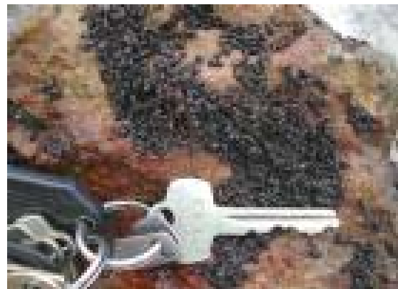
New Zealand Mud Snails