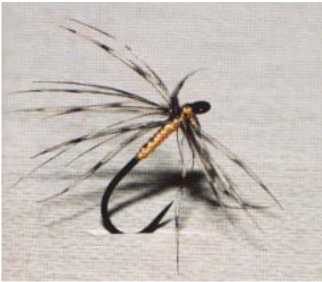
The Partridge and Orange (above) is a classic wet fly pattern, as is the Tup's Indispensable (below).